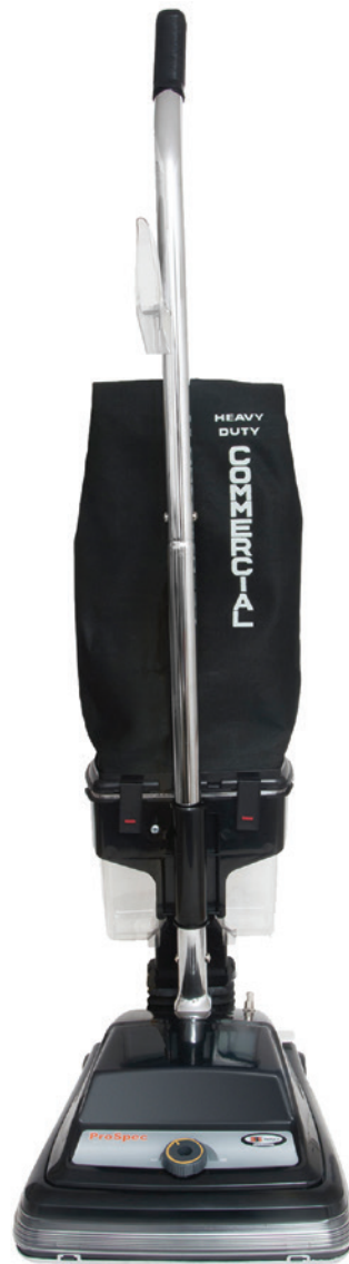
ProSpec HD101DC Dust Cup Model