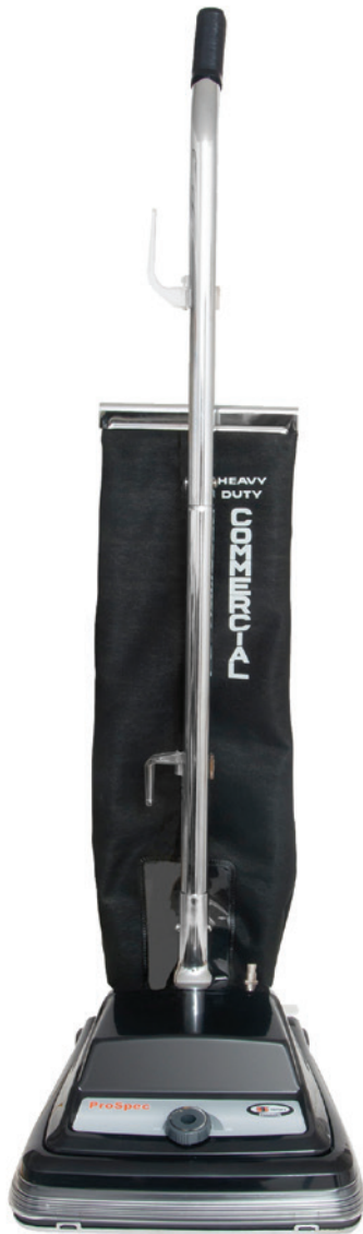
ProSpec HD101 Dual Purpose Zipper Bag