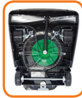
Clear fan cover provides visibility to any blockage

Dual side-suction ports provide efficient edge cleaning